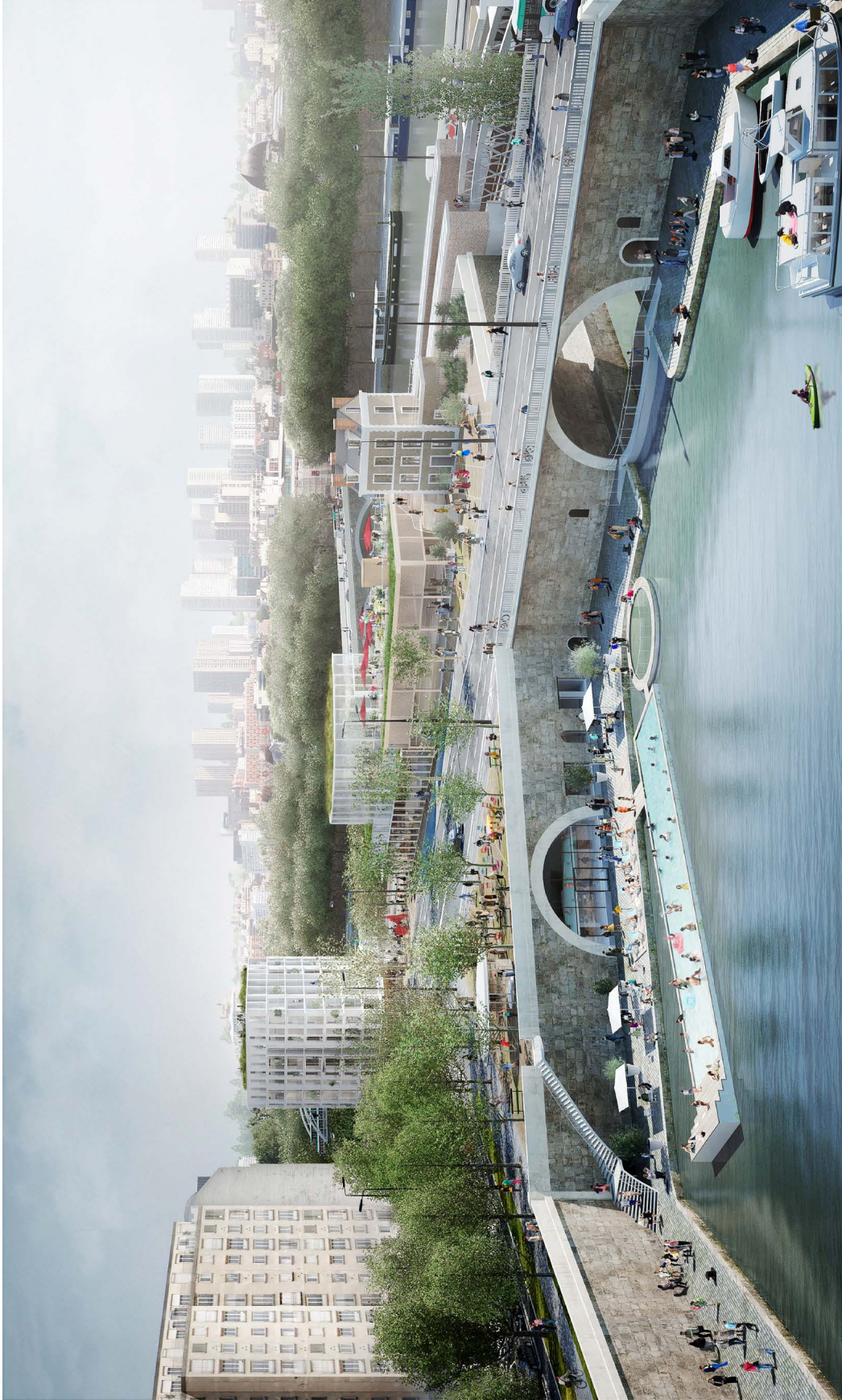
View from the Arsenal Basin. In the foreground, the public plaza overlooking the swimming pool. © laisné roussel et SO-IL (Weiss images)