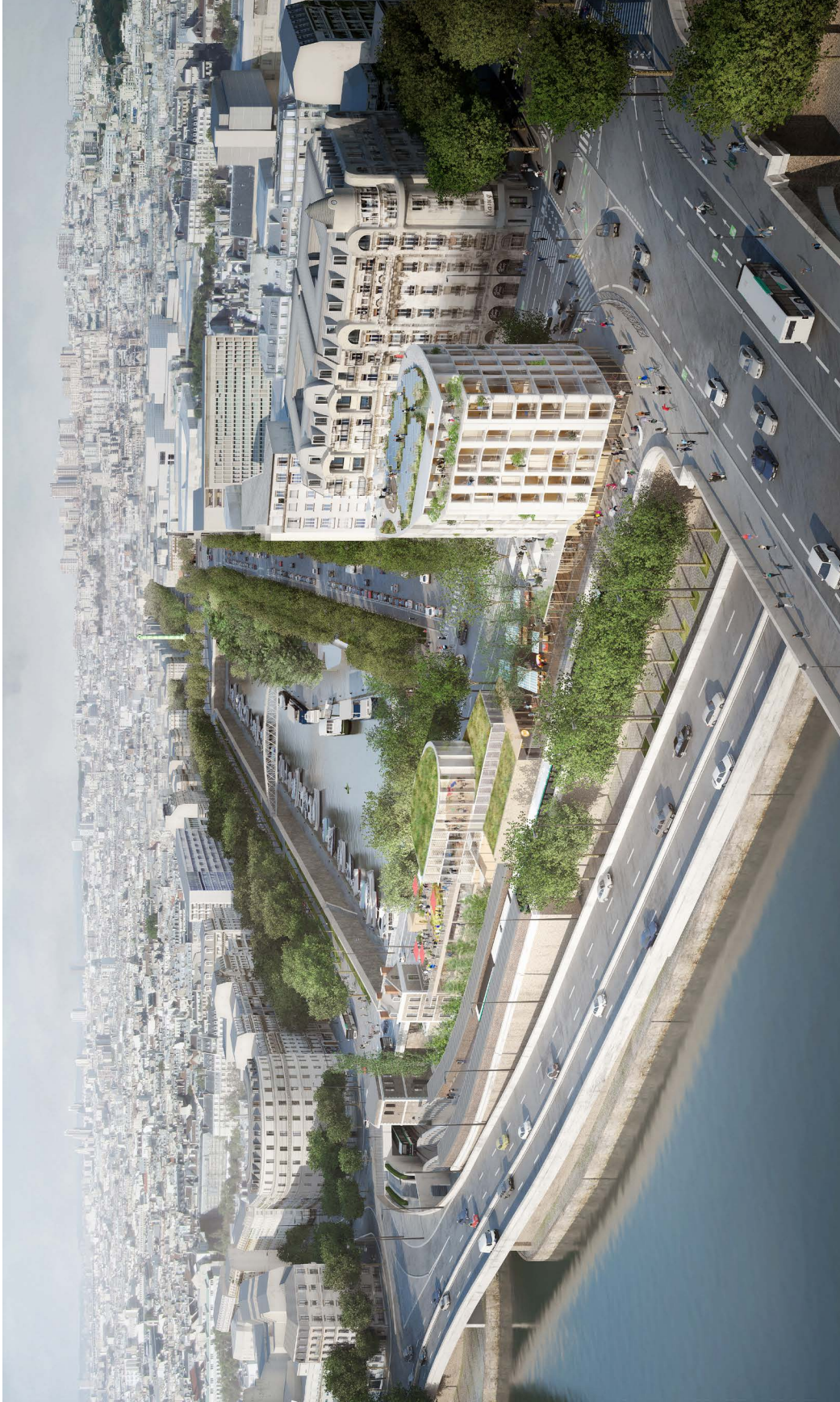
Aerial view from the Pont d'Austerlitz. In the foreground, the housing building and temporary pavilion.