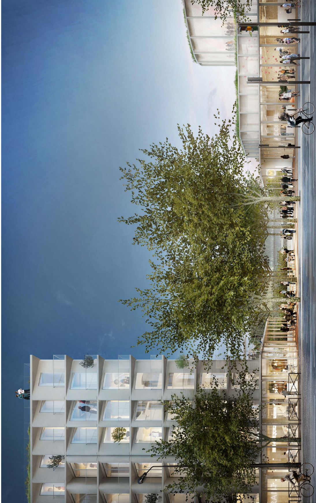
View of the subway plaza from the Quai de la Rapée. On the left, the residential building, on the right, the temporary pavilion.