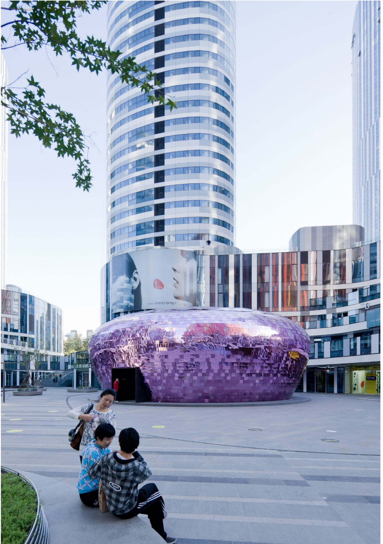
View from plaza