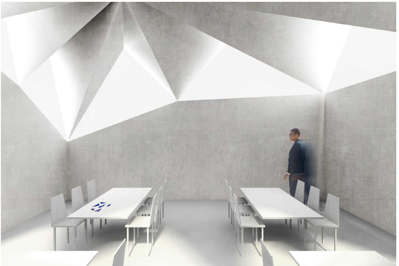
Interior of classroom