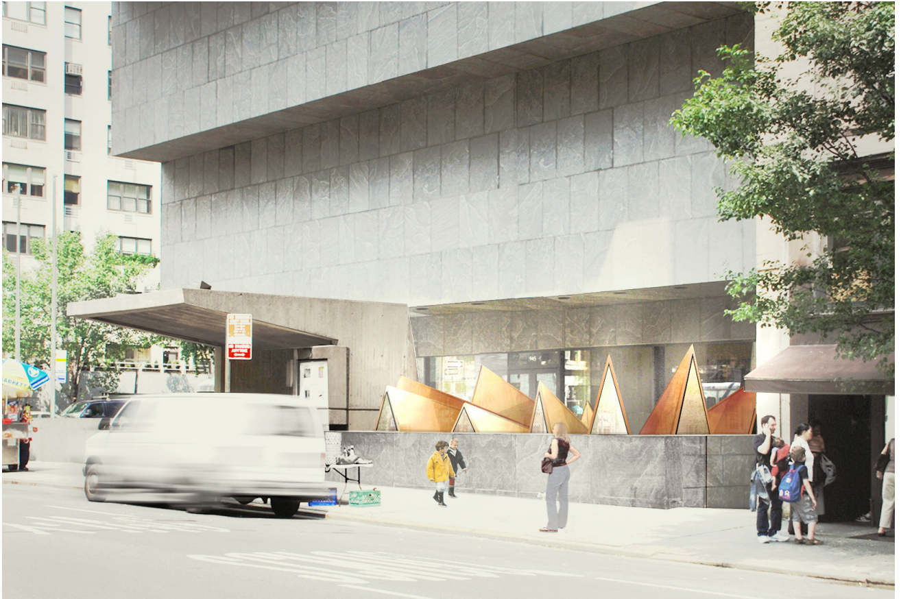
View from Madison Ave