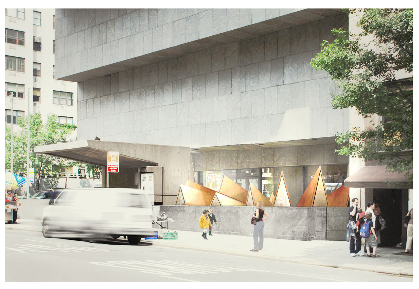
View from Madison Ave