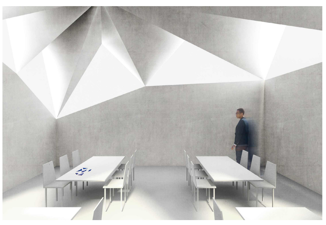
Interior of classroom